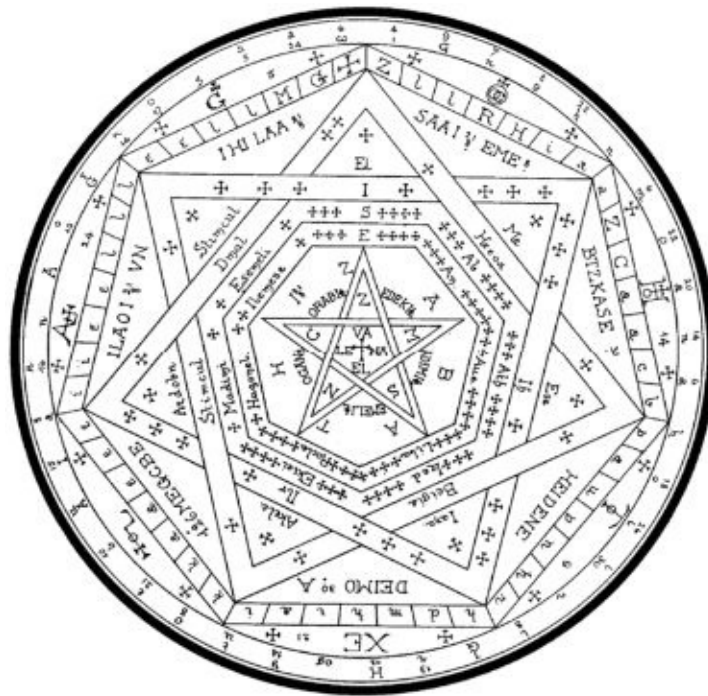
A Magic Circle from the Jewish Kabala (No different than Canaanite Sorcery)