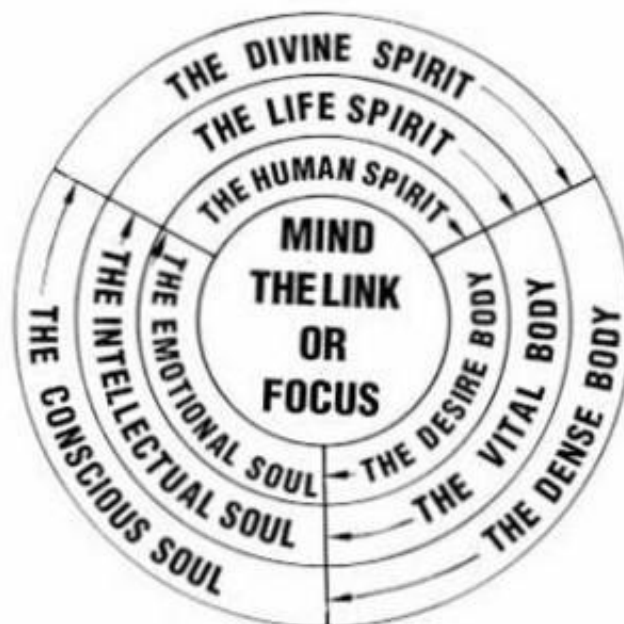
DIAGRAM 5 SHOWS THE TENFOLD CONSTITUTION OF MAN

The pictures in the panorama of the coming life begin at the cradle and end at the grave. This is the opposite direction to that in which they travel in the after-death panorama which passes before the Spirit immediately following its release from the dense body. The reason for this radical difference in the two panoramas is that in the before-birth panorama the object is to show the returning Ego how certain causes or acts always produce certain effects. In the case of the after-death panorama the object is the reverse, that is, to show how each event in the past life was the effect of some cause further back in the life. Nature, or God, does nothing without a logical reason, and the farther we search the more apparent it becomes to us that Nature is a wise mother, always using the best means to accomplish her ends.